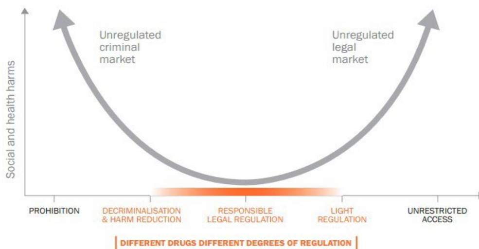
Figure 2 Regulatory models and their impact upon social and health outcomes: 536